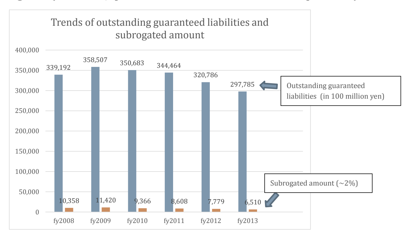
Figure 1 (data from Japan Federation of Credit Guarantee Corporations)