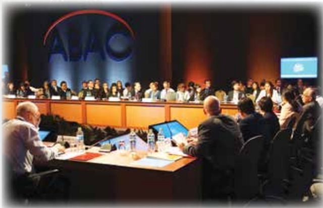
APEC Voices delegates addressing the 4th APEC Business Advisory Council (ABAC) Meeting.

Youth delegates attending the APEC Voices of the Future 2016 were invited to attend the 4th ABAC Meeting where they were given the opportunity to observe the proceedings of the meeting and reports by respective ABAC Members. Three selected APEC Voices delegates from the Philippines, Peru and Vietnam were also invited to present their findings and recommendations to the ABAC Members for consideration. The three youth representatives were very eloquent in their presentation and their messages were very well received and drew much praise from ABAC Members. It was indeed a life-changing experience for many youth leaders to be in the same meeting room with key business leaders from the Asia Pacific region.