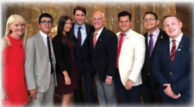
Canada APEC Voices delegates with H.E. Mr Justin Trudeau, Prime Minister of Canada.