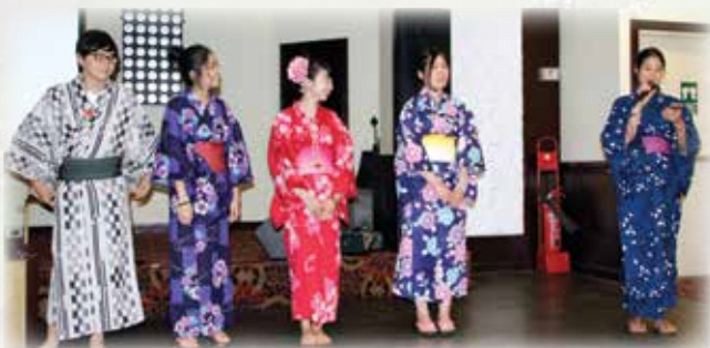
A performance from the Japan APEC Voices delegates in their traditional costumes.