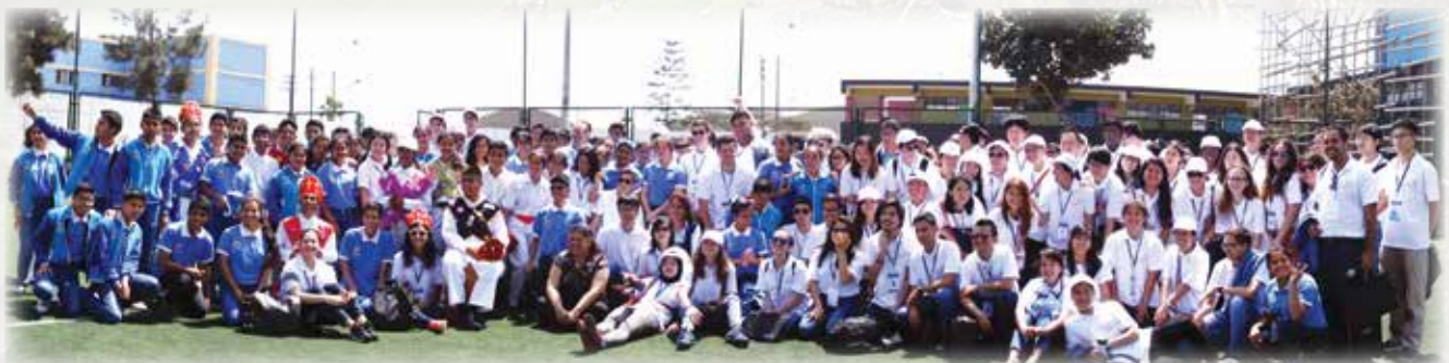
The APEC Voices delegates and their host, the students of Escuela de Talentos coming together for a family photo before the delegates return to Lima.