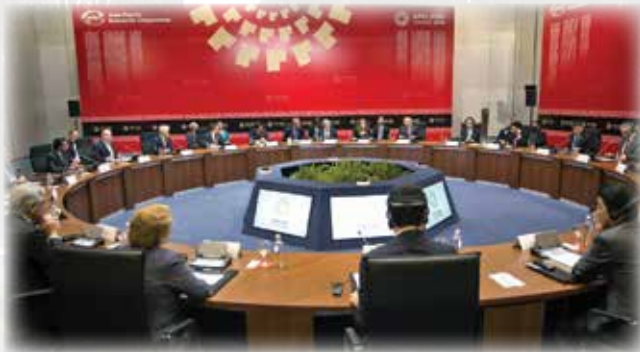
APEC Economic Leaders' Meeting 2016, hosted by H.E. Mr Pedro Pablo Kuczynski, President of the Republic of Peru.

The APEC Leaders' Week 2016 was held in the Peruvian capital, Lima, from 19 to 20 November 2016. Besides the host nation Peru, it was attended by the heads of government from Australia, Brunei, Canada, Chile, China, Hong Kong, Indonesia, Japan, South Korea, Malaysia, Mexico, New Zealand, Philippines, Papua New Guinea, Russia, Singapore, Chinese Taipei, Thailand, Vietnam, as well as the United States of America.