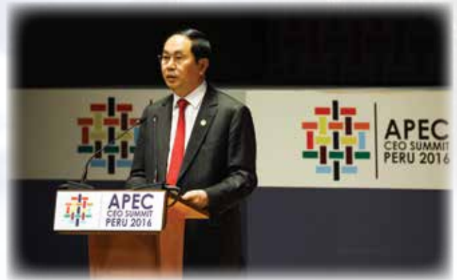
H.E. Mr Tran Dai Quang, President of Vietnam delivering the Closing Remarks at the APEC 2016 CEO Summit held at Gran Teatro Nacional in Lima, Peru. Vietnam will host the APEC Leaders' Week in 2017 in Da Nang, Vietnam.

During the two-day summit, APEC Voices delegates had the opportunity to listen to the address of APEC and business leaders on various issues relating to the regional economy plus a wider global perspective as well. Among the leaders who spoke during the event were H.E. Mr Lee Hsien Loong, Prime Minister of Singapore, H.E. Mr Malcolm Turnbull, Prime Minister of Australia, H.E. Mr Peter O'Neil, Prime Minister of Papua New Guinea, H.E. Mr Xi Jinping, President of the People's Republic of China, H.E. Mr John Key, Prime Minister of New Zealand, H.E. Mr Enrique Pena Nieto, President of Mexico and H.E. Mr Tran Dai Quang, President of the Socialist Republic of Vietnam. Special guests who spoke at the APEC CEO Summit included H.E. Mr Juan Manuel Santos, President of Colombia, Mdm Christine Lagarde, Managing Director, International Monetary Fund (IMF) and Mr Mark Zuckerberg, Chairman and CEO of Facebook, as well as many top business leaders from around the world.