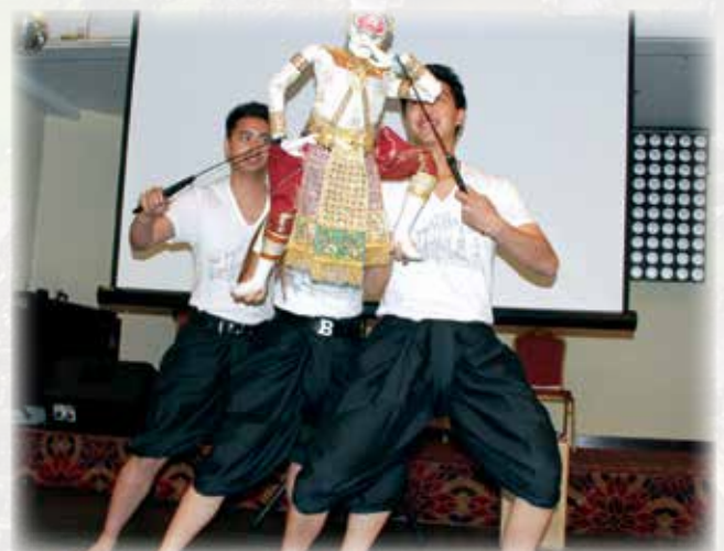
Demonstration of the art of Thai puppetry by the APEC Voices delegates from Thailand.