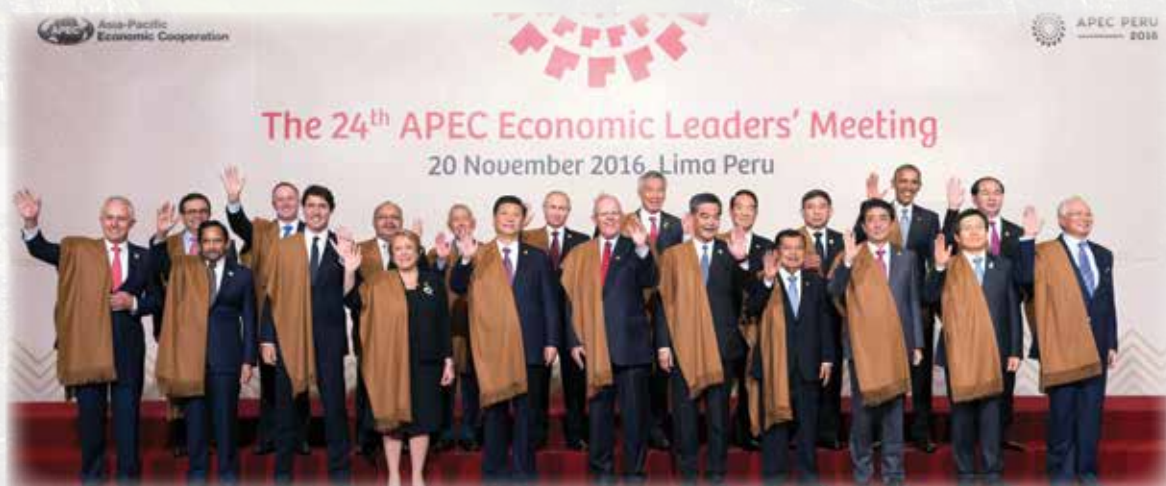
Leaders from the 21 APEC Member Economies gathering for the official group photograph during the APEC Leaders' Week 2016 in Lima, Peru.

In conjunction with the APEC Leaders' Week, the APEC CEO Summit and the ABAC Meeting, the APEC Voices of the Future 2016 was concurrently held from 14 to 20 November 2016 with the support of the Government of Peru, ABAC Peru, the Provincial Government of the Municipality of Callao as well as the Universidad San Ignacio De Loyola in Lima. More than 125 selected youth delegates and educators from 16 APEC Member Economies attended the week-long event in Lima, discussing and exchanging ideas based on the theme for the 2016 APEC Summit "Quality Growth and Human Development" and how young leaders from the Asia Pacific region can play a role and contribute to the success of the region.