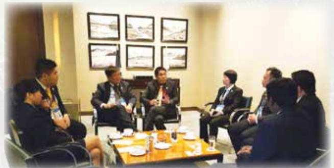
Singapore delegation having a dialogue with Dr Mohamad Maliki Bin Osman, Senior Minister of State for Foreign Affairs and Defence of Singapore.