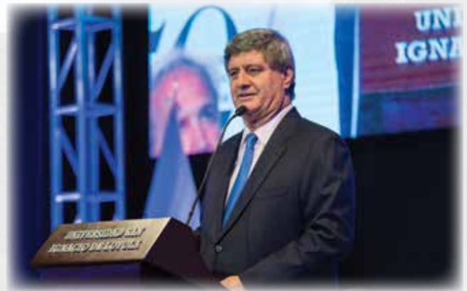
Dr Raul Diez Canseco Terry, former Vice President of the Republic of Peru and Founding President of the Universidad San Ignacio De Loyola, welcoming the APEC Voices delegates to the USIL Campus.