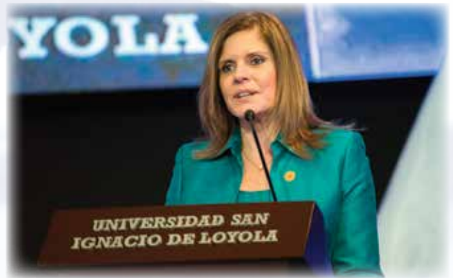
H.E. Dr Mercedes Araoz Fernandez, Vice-President of the Republic of Peru gracing the Opening Ceremony of the APEC Voices 2016 at the Universidad San Ignacio De Loyola.