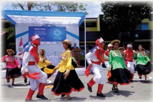
Students from the Escuela de Talentos performing the Peruvian traditional dance to welcome the APEC Voices delegates during their visit to the school in Callao, Peru.

The visit to the Escuela de Talentos is without a doubt, one of the highlights of the APEC Voices 2016 Program in Peru. The visit ended with great admiration by the delegates for the school's management and leadership in providing the opportunity and platform for its students to excel.