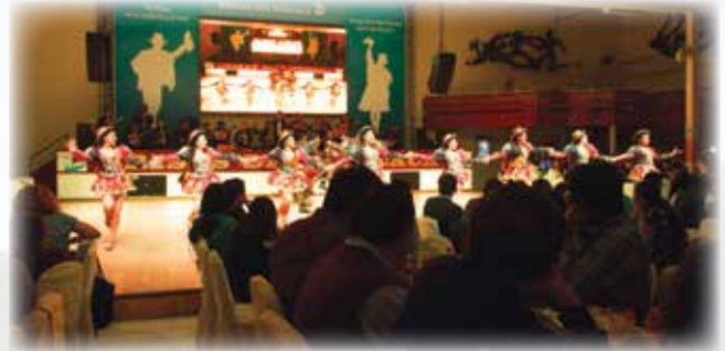
Youth delegates attending a dinner and cultural performance at Brisas del Titicaca in Lima.