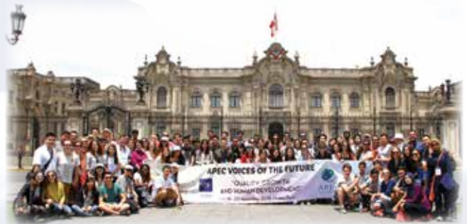
APEC Voices delegates visiting the Presidential Palace in Lima, Peru.