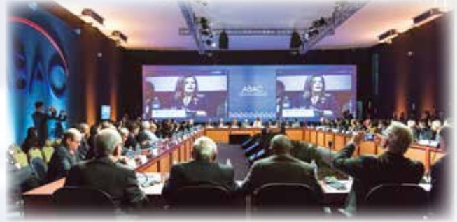
H.E. Dr Mercedes Araoz Fernandez, Vice-President of Peru, gracing the Opening of the 4th APEC Business Advisory Council (ABAC) Meeting in Peru.

The 4th APEC Business Advisory Council Meeting held on 14 November 2016 at the Country Club in Lima was graced by H.E. Dr Mercedes Araoz Fernandez, Vice-President of the Republic of Peru. The meeting was also attended by H.E. Mr Bui Thanh Son, Deputy Minister for Foreign Affairs of the Socialist Republic of Vietnam, the Host Economy for 2017 APEC Leaders' Week in Vietnam.