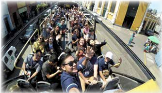
Viewing the rich heritage and architecture in Lima City on board a double decker bus is an experience of a lifetime.

APEC Voices delegates were treated with a visit to its 400-year old historic district, which is home to true architectural jewels reminiscent of the 17th and 18th century Baroque and Rococo art movements. They tasted Peru's varied and exquisite food, and visited museums and old churches. For the youth delegates visiting Peru for the first time, it was certainly an unforgettable experience.