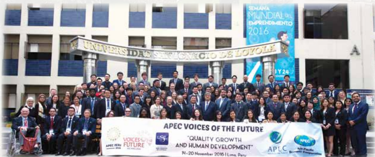
APEC Voices 2016 delegates with officials at the Universidad San Ignacio De Loyola Campus.

H.E. Dr Mercedes Araoz Fernandez Vice-President The Republic of Peru