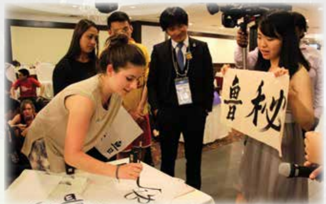
APEC Voices delegates learning the art of Chinese calligraphy from their Chinese counterparts.