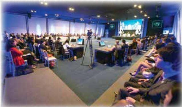
The APEC Voices 2016 Opening Ceremony at the Universidad San Ignacio De Loyola in Lima, Peru.

"It is time for your generation to take responsibility in promoting a stronger regional economy. I believe that, through the bonds forged between you and your fellow delegates, you will all grow to be strong, connected leaders of tomorrow who will be well-positioned to build a better world together."