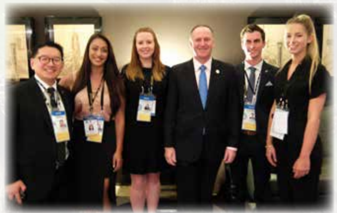
New Zealand APEC Voices delegates with H.E. Mr John Key, Prime Minister of New Zealand.