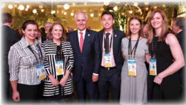
Australia APEC Voices delegates with H.E. Mr Malcolm Turnbull, Prime Minister of Australia.

Attending the APEC CEO Summit was a once-in-a-lifetime experience for many youth leaders from the Asia Pacific region especially those attending the event for the first time where they were given the opportunity to hear speeches by Heads of Government, Ministers and world leaders in business. The insight gained from attending the APEC CEO Summit no doubt left a deep impression on these future leaders of the Asia Pacific region. Many youth delegates also had the opportunity to engage with APEC leaders, Ministers and ABAC Members from their own economies during the APEC Summit.