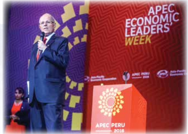
H.E. Mr Pedro Pablo Kuczynski, President of the Republic of Peru gracing the Opening Ceremony of the APEC 2016 CEO Summit at the Gran Teatro Nacional, Lima, Peru.

The Government of the Republic of Peru, the APEC Summit 2016 Host Committee and the APEC Business Advisory Council (ABAC) have made Peru proud by organizing a very successful APEC Leaders' Week last year.