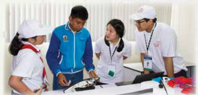
Students at the Escuela de Talentos sharing their comprehensive training that integrates technology with entrepreneurship with APEC Voices delegates.