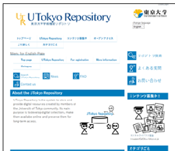
Top page of UTokyo Repository

( https://repository.dl.itc.u-tokyo.ac.jp/?lang=english )