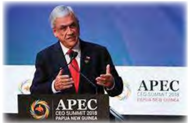
H.E. Sebastian Pinera, President of Chile addressing the APEC CEO Summit 2018 on board the Cruise Liner The Pacific Explorer.