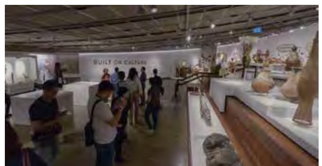
Visiting the National Museum and Art Gallery of Papua New Guinea was a rare treat for the APEC Voices delegates.

During their stay in Port Moresby, delegates also visited the National Museum and Art Gallery showcasing artifacts from 19 provinces of Papua New Guinea, with collections that dated as far back as 1800. The delegates saw the best of PNG as they explored SME stalls at the International Convention Centre, where many local arts and crafts were on display, showcasing the rich tribal culture of Papua New Guinea.