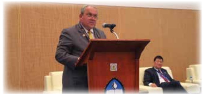
H.E. Justin W. Tkatchenko, Minister for APEC addressing at the Opening Ceremony of the APEC Voices 2018 Youth Summit at the University of Papua New Guinea.

Minister Tkatchenko extended a warm welcome to the APEC Voices delegates and educators from 15 APEC Member Economies to Papua New Guinea, and congratulated the momentous occasion of the 20th Anniversary of the APEC Voices of the Future program. The Minister encouraged the young leaders to fully utilize the platform, engage with APEC and Business Leaders, extend their network with fellow delegates, and work together to create a more vibrant and dynamic Asia-Pacific region. He also encouraged the delegates to explore the rich culture and traditions of Papua New Guinea.