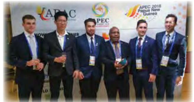
A night of interaction and networking amongst the APEC Voices delegates and business leaders on board The Pacific Explorer.