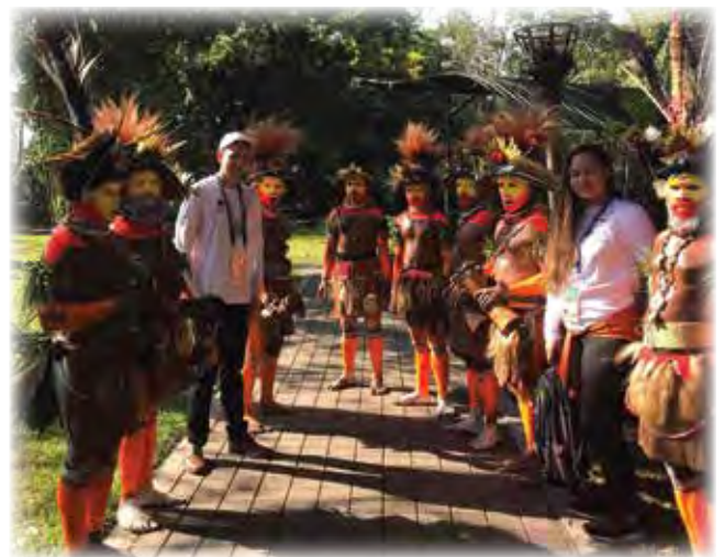
APEC Voices delegates visiting the Port Moresby Nature Park, away from the hustle and bustle of the Port Moresby city area.

After the visit to the ExxonMobil LNG Plant, the delegates proceeded to the Port Moresby Nature Park for lunch, away from the hustle and bustle of the Port Moresby city area. Upon their arrival, the delegates were greeted with song and dance by the tribes dressed in traditional tribal outfits. The Port Moresby Nature Park is Papua New Guinea's leading botanical and native zoological park and garden, which showcased the best of PNG's flora and fauna. The park has been home to over 250 native animals, including birds of paradise, tree-kangaroos, cassowaries, wallabies, snakes, crocodiles, hornbills and multiple parrot species.