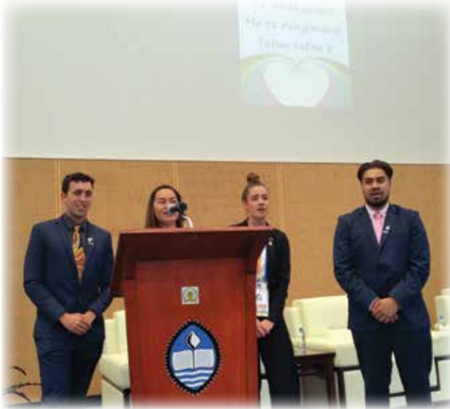
Team from APEC Voices New Zealand presenting their Economy Report at the APEC Voices 2018 Youth Summit.

The delegates were divided into four main groups, and each group was assigned to discuss and tackle issues related to various topics, namely: Harnessing Technology for a Better Future, the Role of Education in Preparing our Youth for the Future, Digital Innovation: Opportunities and Challenges for our Young People and Harnessing Inclusiveness: Challenges and Opportunities. The delegates then disbursed to various parts of the campus for their deliberations.