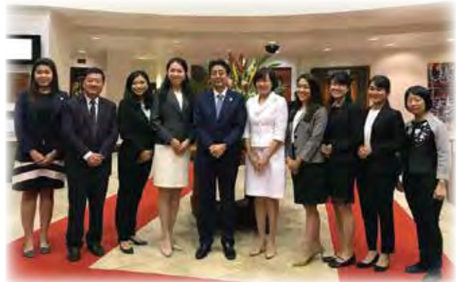
APEC Voices officials and Japanese APEC Voices delegates with H.E. Shinzo Abe, Prime Minister of Japan and Mrs Akie Abe.