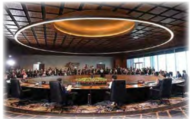
APEC Economic Leaders' Meeting 2018 hosted by H.E. Peter O'Neill, Prime Minister of Papua New Guinea at the APEC Haus, Port Moresby.