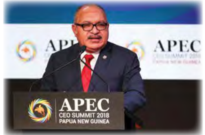
H.E. Peter O'Neill, Prime Minister of Papua New Guinea gracing the Opening Ceremony of the APEC 2018 CEO Summit on board the P&O Cruise Liner, The Pacific Explorer at Port Moresby.

In conjunction with the APEC Economic Leaders' Week 2018, the APEC CEO Summit and ABAC Meeting, the APEC Voices of the Future 2018 was held concurrently in Port Moresby, the capital of Papua New Guinea. The topic for APEC Voices of the Future 2018 was in line with the theme of APEC 2018, “Harnessing Inclusive Opportunities, Embracing the Digital Future”. This addressed harnessing technology for a better future and the role of youth in their own home economies to support digital innovation.