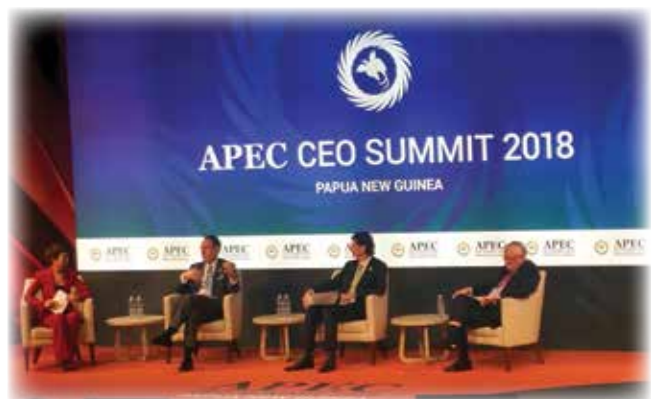
APEC CEO Summit 2018 held at the auditorium on board the Cruise Liner The Pacific Explorer.