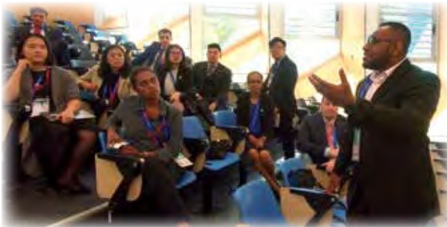
Intense discussion among the APEC Voices 2018 delegates on issues concerning young people in their respective APEC Members Economies.

Another group was specially selected by their economies to work on the APEC Youth Declaration 2018. The main framework was agreed upon and the group responsible for the Youth Declaration waited anxiously for the input of the break-up group, with the hope that the declaration would be a fair representative of the APEC Voices delegates 2018. The educators played a crucial role in facilitating the group discussions, but avoided influencing the outcome of the discussions.