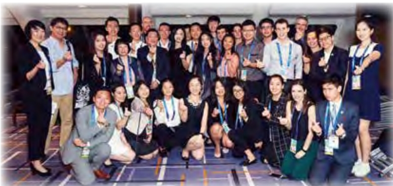
APEC Voices 2018 officials and delegates with Ms Yao Chen, Guest Speaker at the Dialogue Session.

APEC Voices delegates attended a sharing session by Yao Chen, a Chinese actress and philanthropist. In 2014, Time had named her as one of the most influential people on the Time 100 list. She was also listed by Forbes as the 83rd most powerful woman in the world. Several Western media outlets have even nicknamed her as “China’s answer to Angelina Jolie.” She shared her UN refugee work with the APEC Voices delegates and how she had been making a difference to create an impact for the community in China. She encouraged the young delegates to have a positive attitude and contribute their best for their communities.