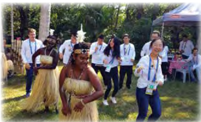
APEC Voices delegates learning the traditional cultural dance at the Port Moresby Nature Park.

During their stay in Port Moresby, delegates also visited the National Museum and Art Gallery showcasing artifacts from 19 provinces of Papua New Guinea, with collections that dated as far back as 1800. The delegates saw the best of PNG as they explored SME stalls at the International Convention Centre, where many local arts and crafts were on display, showcasing the rich tribal culture of Papua New Guinea.