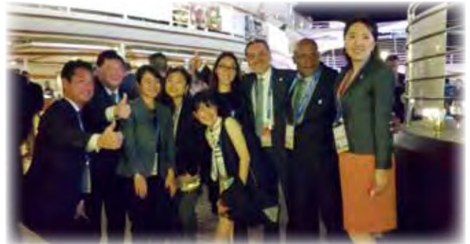
APEC Voices delegates networking with business leaders at the APEC CEO Reception on board The Pacific Explorer.