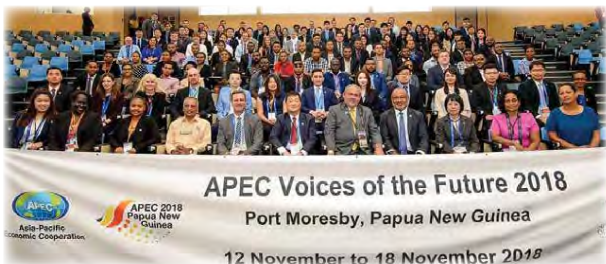
APEC Voices 2018 officials and delegates from the 15 APEC Member Economies at the APEC Voices 2018 Opening Ceremony held at the University of Papua New Guinea.