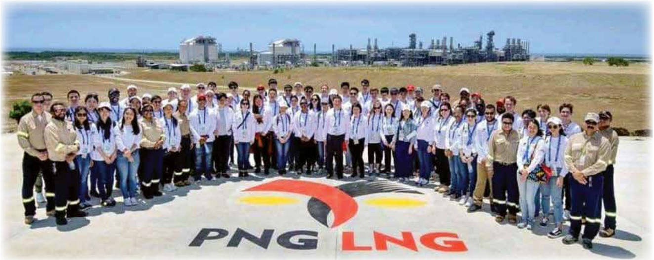
APEC Voices 2018 delegates visiting the ExxonMobil LNG Plant at Caution Bay on the South Coast of PNG's Central Province.

The APEC Voices delegates and educators deserved a good break after their intense discussion at the Youth Forum 2018 on the 3rd day of the APEC Summit. The first order of the day was a specially arranged trip to the ExxonMobil PNG LNG Plant which is located 20 kilometers northwest of Port Moresby, at Caution Bay on the South Coast of PNG's Central Province. The LNG Plant was operating by receiving natural gas from the Hides Gas Conditioning Plant through a 700-kilometre pipeline.