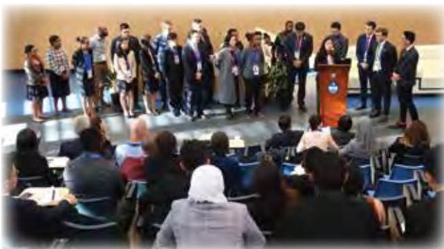
Group presentation from the APEC Voices 2018 delegates on their deliberation at the APEC Voices 2018 Youth Summit.

The group presentations were of high standards with much in-depth discussion, and the delegates articulated themselves well during the question-and-answer sessions. To tackle the issue of inclusivity, one group suggested coming up with APEC key performance indicators for each APEC economy so that the APEC Leaders would be able to better identify gaps and produce targeted solutions. Delegates also recognized the importance of education and that some economies do not have equal access to education. They hence proposed an APEC Youth Fund that could benefit and provide struggling economies with necessary resources for an improved education system for young people. The representatives worked vigorously through the night on board the cruise ship to finish the tasks assigned.