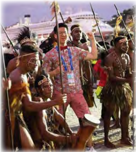
A night of fun and enjoyment for the APEC Voices delegates at the APEC CEO Summit Cultural Night Dinner event.

The APEC CEO Summit 2018 Cultural Night and Dinner - A World of Astounding Diversity was held at the wharf area where delegates were welcomed by various tribal groups in traditional tribal costumes. The party arrived with delicious traditional food and drinks and delegates enjoyed the peaceful seafront ambience with concerts and performances.