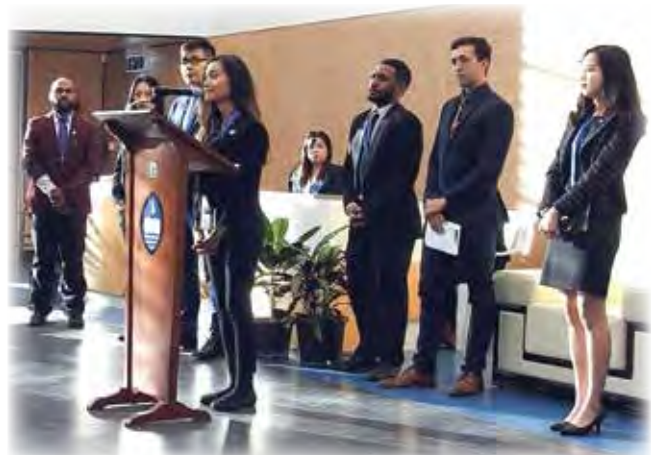
Group presentation on their discussion at the APEC Voices 2018 Youth Summit.