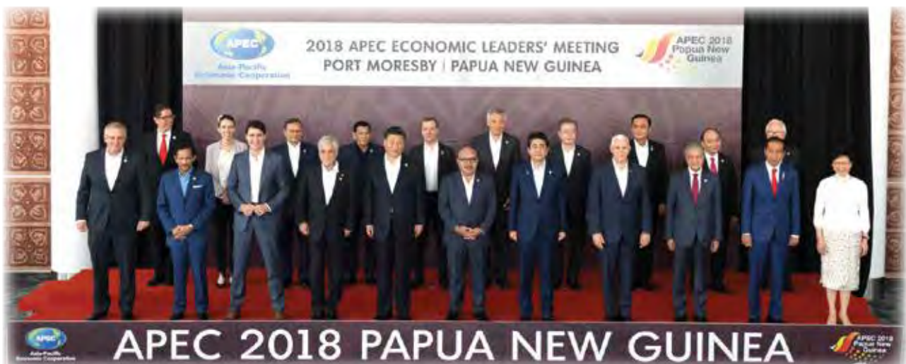
Leaders from the 21 APEC Member Economies gathering for the official group photograph during the APEC Leaders' Week 2018 in Port Moresby, Papua New Guinea.