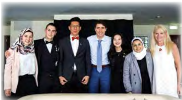
APEC Voices delegates from Canada with H.E. Justin Trudeau, Prime Minister of Canada.

H.E. Dr Mahathir Bin Mohamad Prime Minister of Malaysia