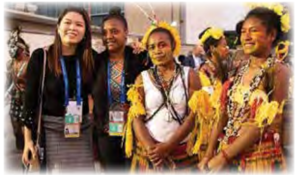
APEC Voices delegates with tribal members at the Cultural Night and Dinner event.