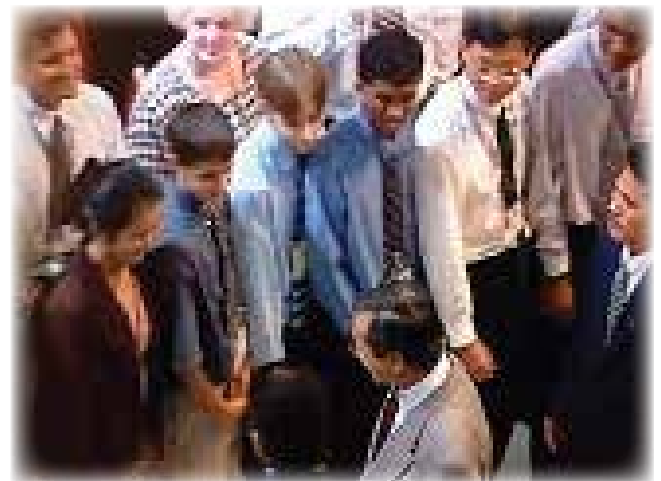
H.E. Tun Dr Mahathir Mohamad, Prime Minister of Malaysia, interacting with APEC Voices Delegates in Kuala Lumpur, Malaysia.