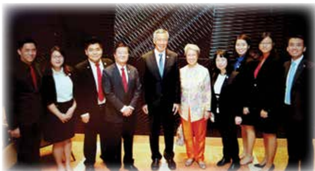
APEC Voices delegates from Singapore with H.E. Lee Hsien Loong, Prime Minister of the Republic of Singapore, and Mrs. Lee.