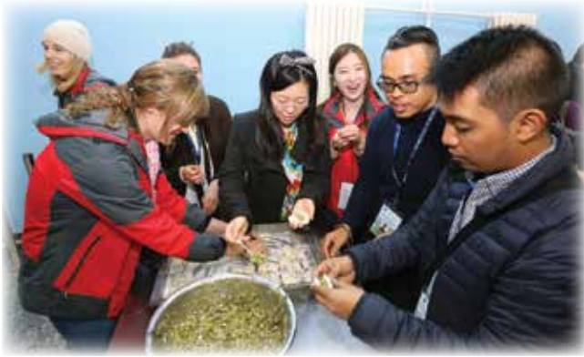
Being involved in the preparation of traditional food such as dumplings makes the visit more interesting and enriching for the delegates.