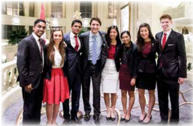
APEC Voices delegates from Canada with H.E. Justin Trudeau, Prime Minister of Canada.