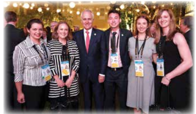
Australian APEC Voices delegates with H.E. Malcolm Turnbull, Prime Minister of Australia.