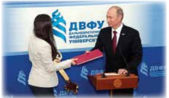
APEC Voices Representative from Russia presenting the APEC Voices Youth Declaration to H.E. Vladimir Putin, President of Russia in Vladivostok, Russia during the APEC Summit, 2012.

"You are the heirs to both the legacy and consequences of our present actions; your opinion matters as much as ours. I encourage you to tell us all of your concerns, your dreams, and the kind of global community you envision, so that together, we can shape a world that we can proudly bequeath to coming generations."