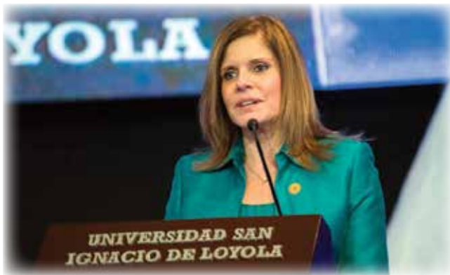
H.E. Dr Mercedes Araoz Fernandez, Vice-President of the Republic of Peru gracing the Opening Ceremony of the APEC Voices at the Universidad San Ignacio De Loyola in Lima, Peru.

“One day, in the not-too-distant future, your generation will be called upon to take up the mantle of promoting a stronger regional economy among APEC member nations. I encourage you to get to know your fellow Voices of the Future delegates. Together, you will be responsible for shaping the future of our global economy.”