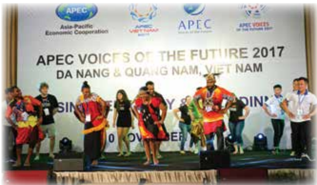
A stunning cultural performance by the youth delegates from Papua New Guinea.