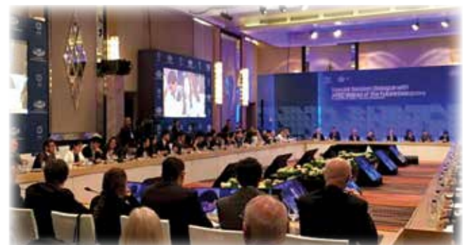
Special dialogue session between Members of the APEC Business Advisory Council and delegates from the APEC Voices at the Fairmont Hotel in Manila, Philippines.

H.E. Hillary Rodham Clinton Secretary of State United States of America, 2011