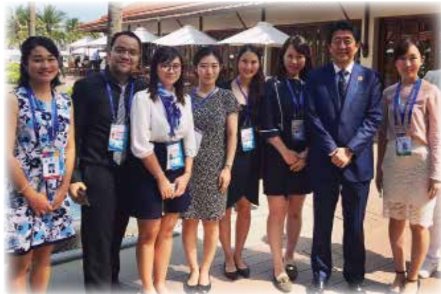
APEC Voices delegates from Japan with H.E. Shinzo Abe, Prime Minister of Japan.