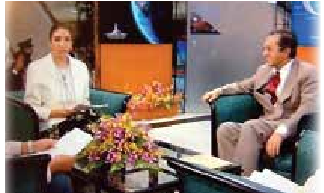
Dialogue with H.E. Tun Dr Mahathir Mohamad, Prime Minister of Malaysia, during the APEC Voices Summit in Kuala Lumpur, Malaysia.

Today, the APEC Voices of the Future Program is recognized as an official Youth Program endorsed by the APEC Secretariat and held in conjunction with the APEC Leaders' Week, providing the opportunity and platform for young leaders and educators from the 21 APEC Economies to attend the ABAC Meetings and the APEC CEO Summit.