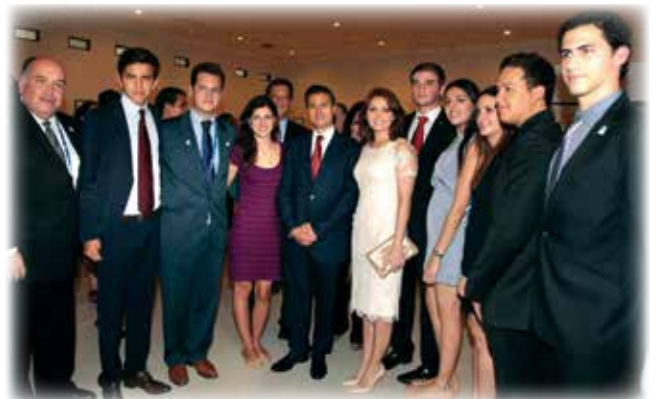
The APEC Voices Delegates of Mexico with H.E. Enrique Pena Nieto, President of Mexico and the First Lady Angelica Rivera in Bali, Indonesia.

H.E. Benigno S. Aquino III President of the Republic of the Philippines, 2015