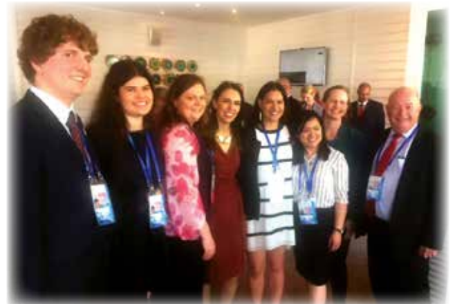
APEC Voices delegates from New Zealand with H.E. Jacinda Ardern, Prime Minister of New Zealand.