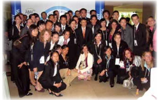
APEC Voices Delegates with Jack Ma, Executive Chairman, Alibaba Group in Lima, Peru in 2008.

APEC Voices Leadership Council received very encouraging feedback from both government as well as the business communities as we move forward to prepare the next APEC Voices Program with the Host Economies.