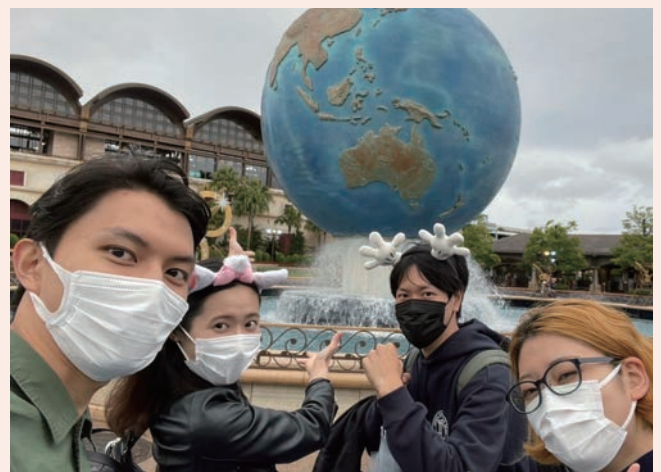
Together with classmates

As someone who has spent less than a year in the program, I feel somewhat hesitant to offer my opinion on this, but I would say that, at GraSPP, I have had numerous opportunities to learn invaluable lessons from teachers who have gained diverse experiences on the frontlines of the public sector. It goes without saying that their lectures have been a rich source of knowledge, but what left the greatest impression on me has been the opportunity to experience first-hand their passion to make people happy as an extension of their everyday work. I, too, intend to value and preserve this approach in my future field work in the public sector.