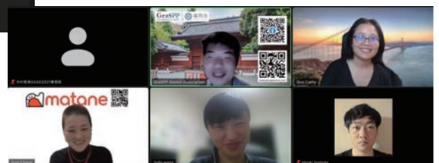
↓ Session in the Japanese-language room in Talk Session 2