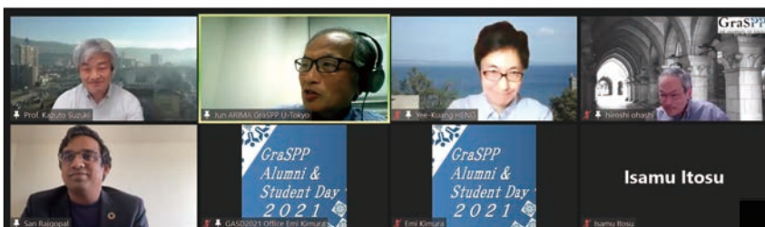
↓ Panel discussion in Talk Session 1