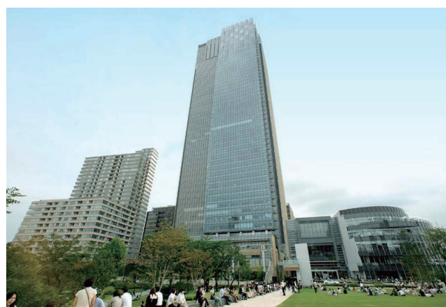
Tokyo Midtown : Example of Broader Application of Real Estate Securitization

Real estate securitization is still an emerging field despite real estate's pervasive influence over human livelihood. If we think of real estate securitization as a mechanism for combining real estate with the monetary system, there is nothing unusual about it. In closing, we would like to extend an invitation to individuals with a diversity of perspectives ranging from municipal development to finance to participate in our activities and humbly ask for all those in GraSPP to lend us your support.