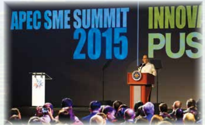
H.E. President Benigno S. Aquino III giving his address at the Opening of the APEC SME Summit 2015 at the Green Sun Hotel in Makati City, Philippines.

After the APEC SME Summit, APEC Voices delegates were invited to tour the exhibition hall and view the exhibits put up by the small and medium enterprises, both from the Philippines and from around the world. The participation of the APEC Voices delegates provided them valuable insights in the world of small and medium enterprises and how they can also contribute to the success and economy in the Asia-Pacific region.