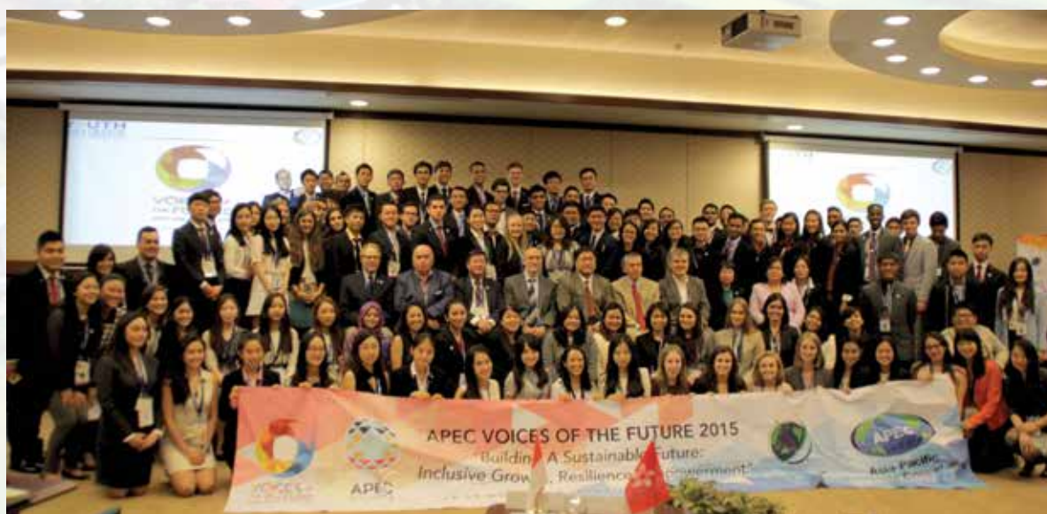
APEC Voices delegates with H.E. Cesar V. Purisima, Secretary of Finance, H.E. Philip Goldberg, U.S. Ambassador to the Philippines, senior officials of Asian Development Bank and the APEC Voices Leadership Council.

H.E. Cesar V. Purisima Secretary of Finance Republic of the Philippines