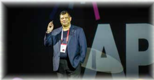
Distinguished speaker Tony Fernandes, Group CEO, AirAsia, speaking on how AirAsia responds to new consumer demands.

The theme of the APEC SME Summit 2015 was on “Innovation and Big ideas: Pushing Boundaries”, and was graced by H.E. Benigno S. Aquino III, President of the Republic of the Philippines. At the official opening, President Aquino delivered the keynote address on “Innovation and Inclusiveness: The Path to a Better Future.” Distinguished speakers such as Josette Sheeran, President, Asia Society; David Plouffe, Chief Advisor and Member, Board of Directors, Uber; Tony Fernandes, CEO, AirAsia and Founder, Tune Air; and many leaders of industries shared their experiences at the event.