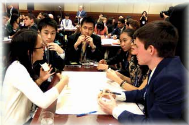
Youth leaders from the Asia-Pacific region engaging in a group discussion related to trade issues in the region.