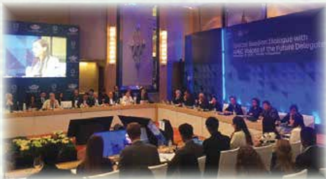
Special dialogue session between Members of the APEC Business Advisory Council and delegates from the APEC Voices 2015 at the Fairmont Hotel in Manila, Philippines.

The dialogue with ABAC Chairs and Members was a huge success; the APEC Voices delegates put across their views eloquently and raised issues of concern regarding trade policies in the Asia-Pacific region.