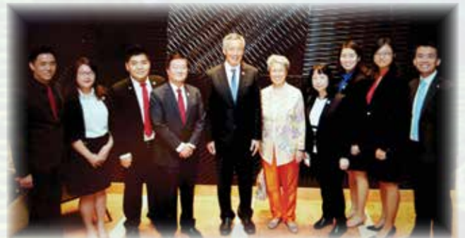
APEC Voices delegates from Singapore with H.E. Lee Hsien Loong, Prime Minister of the Republic of Singapore, and Mrs Lee.