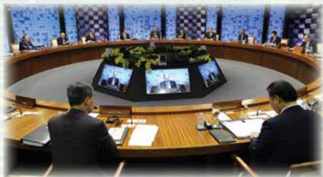
APEC Leaders Meeting held at The Philippine International Convention Center in Manila, Philippines.

The APEC Leaders' Week 2015 was held in Manila, Philippines, from 18 to 19 November 2015. It was attended by the heads of government from Australia, Brunei Darussalam, Canada, Chile, The People's Republic of China, Hong Kong SAR, Japan, South Korea, Malaysia, Mexico, New Zealand, Papua New Guinea, Peru, Singapore, Thailand, Vietnam, the United States of America, and the representatives from Chinese Taipei, Indonesia, Russia and the host economy, the Philippines.