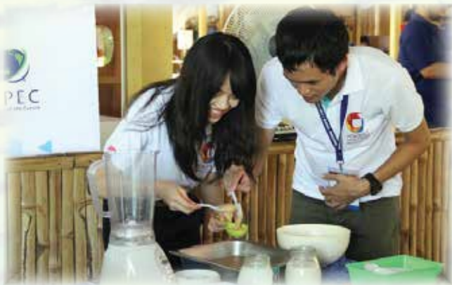
A hands-on experience with GK Farm's social enterprise programs.