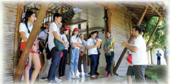
A volunteer briefing the APEC Voices delegates on the mission of GK Farm.