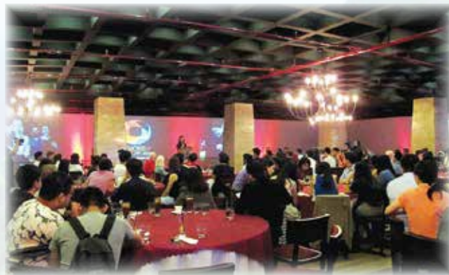
Youth leaders from the 17 APEC Member Economies making new friends and building networks during the APEC Week in Manila.