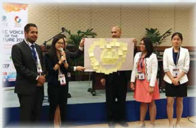
APEC Voices delegates presenting their report at the Youth Forum.

After the opening ceremony, the APEC Voices of the Future Youth Forum began with the theme: “How Youth Can Play a Role in Building Sustainable and Resilient Communities in the Asia-Pacific Region”. During the Plenary Session, each economy was represented by a youth delegate who spoke on the theme of the youth forum. The session concluded with an engaging question-and-answer segment.