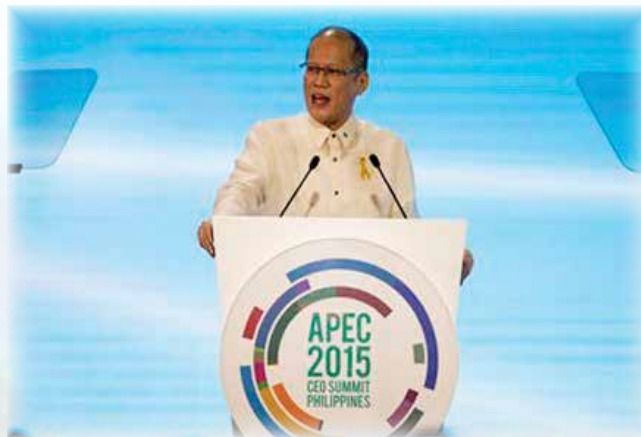
H.E. Benigno S. Aquino III, President of the Republic of the Philippines, giving his address at the Opening Ceremony of the APEC 2015 CEO Summit at the Makati Shangri-La Hotel in Manila, Philippines.

The Government of the Philippines, the APEC Summit 2016 Host Committee and the APEC Business Advisory Council (ABAC) have made the Philippines proud by organizing a smooth and successful APEC Leaders' Week 2015 in November last year.