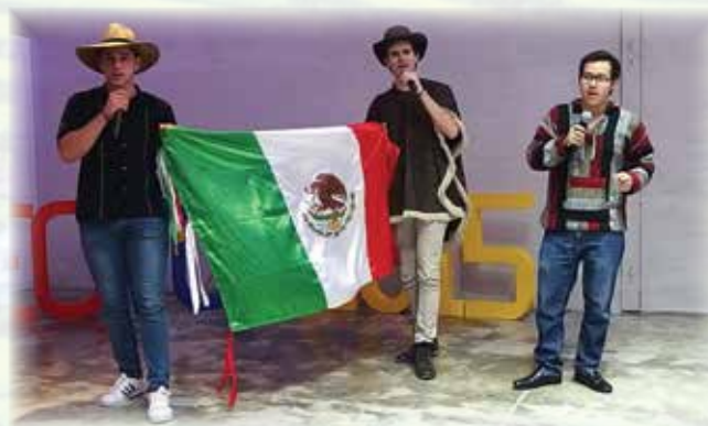
The APEC Voices delegates from Mexico presenting a song item at the Closing Ceremony.