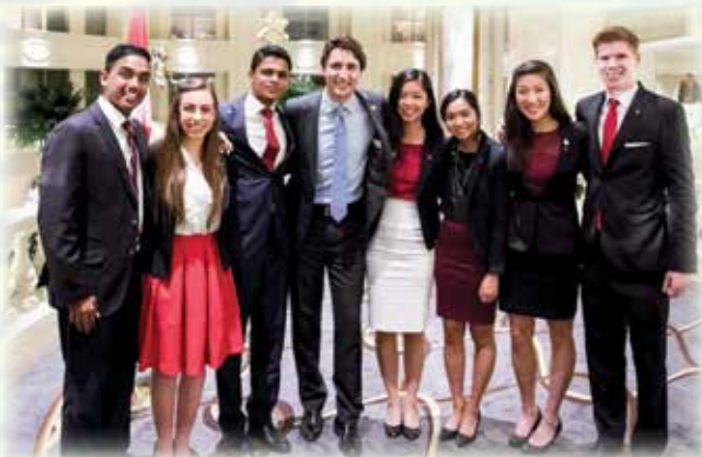
APEC Voices delegates from Canada with H.E. Justin Trudeau, Prime Minister of Canada.