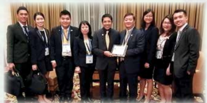
APEC Voices delegates from Singapore with H. E. Dr Maliki Osman, Senior Minister of State for Foreign Affairs and Defence of the Republic of Singapore.