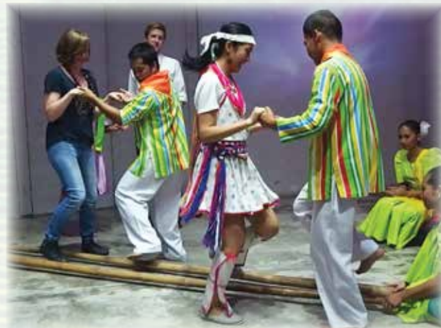
APEC Voices delegates learning the traditional bamboo dance from their Filipino friends at the APEC Voices 2015 Closing Ceremony.