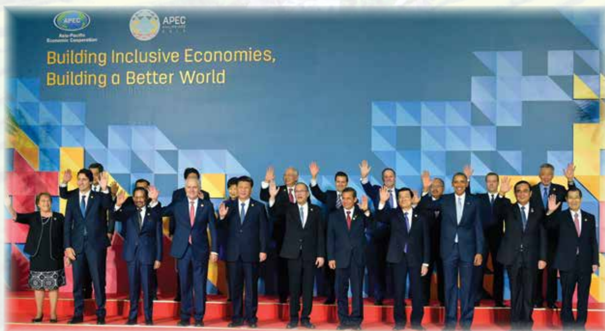
Leaders from the 21 APEC Member Economies gathering for the official group photograph during the APEC Leaders' Week 2015 hosted by H.E. Benigno S. Aquino III of the Republic of the Philippines.

In conjunction with the APEC Leaders' Week, the APEC CEO Summit and the ABAC Meetings, the APEC Voices of the Future 2015 was concurrently held from 12 to 19 November 2015 with the support of the Government of the Philippines, the APEC CEO Host Committee and ABAC Philippines. 130 selected youth delegates from the 17 APEC member economies also gathered in Manila during the period to interact, discuss and exchange ideas based on the theme for the 2015 APEC Summit: "Building Inclusive Economies, Building a Better World."