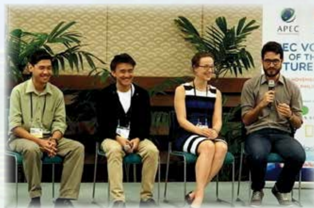
Guest presenters from AISEC International and NGO representatives from the Philippines sharing about their projects with APEC Voices delegates.

Three Youth4ASIA Winners from ADB were also invited to share about their projects: the “Advancement for Rural Kids” project focuses on improving the education and health of school children living in impoverished rural communities in developing countries, the “Alay Ni Ignacio Summer School” project conducts a seven-week summer supplementary program in Maths, Science and English for underprivileged children, and “Project H20” ensures water availability during disasters in the Philippines by delivering potable water to communities in need through the use of ‘cutting edge mobile filtration devices’.