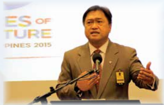
H.E. Cesar V. Purisima, Secretary of Finance of the Republic of the Philippines, giving his address at the APEC Voices 2015 Youth Forum Opening Ceremony at the Asian Development Bank Headquarters in Manila, Philippines.

The official opening ceremony held at the ADB headquarters on 14 November 2015 and was graced by the Secretary of Finance, H.E. Cesar V. Purisima. In his address, Finance Secretary Purisima shared many stories on the importance of relations and respect for each other in overcoming challenges faced by the region. He reminded the delegates that they could not afford to sit back during crucial times as they will inherit the shared future that is currently being built. Thus, it is crucial for youth to engage policymakers meaningfully as they develop plans and initiatives towards achieving peace and prosperity for all.