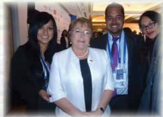
APEC Voices delegates from Peru with H. E. Michelle Bachelet, President of Chile.