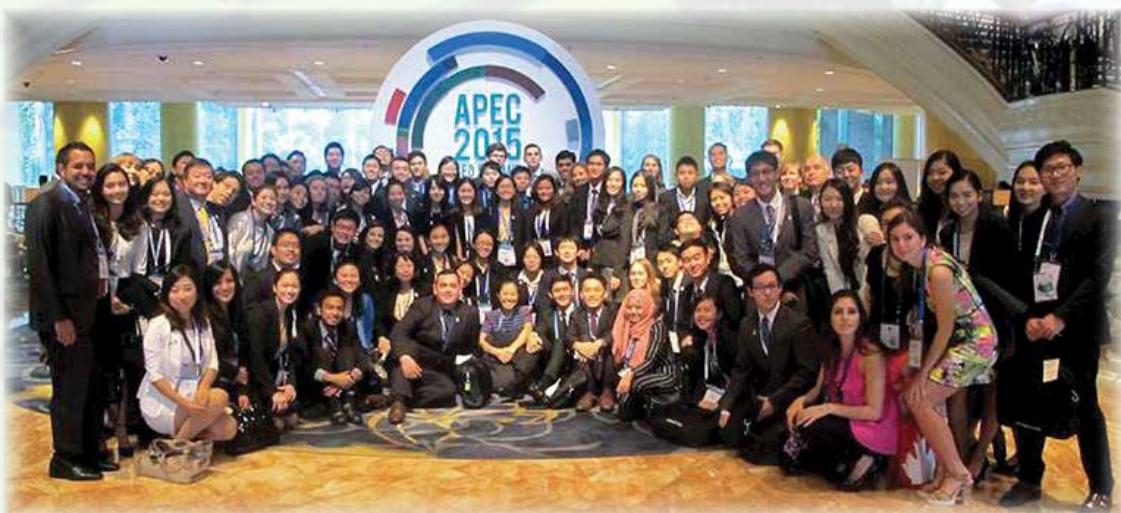
APEC Voices delegates from 17 APEC Member Economies at the APEC CEO Summit 2015 at the Makati Shangri-La Hotel.