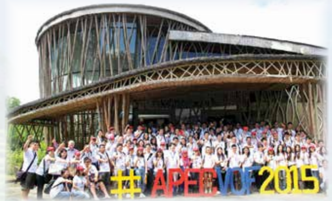
The APEC Voices delegation at the Gawad Kalinga Enchanted Farm at Bulacan, Philippines.