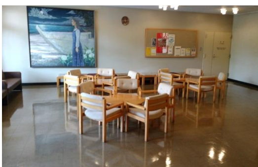
Lounge, Sanjo Conference Room B1 35 seats available

Welfare Team Education and Student Support Dept.