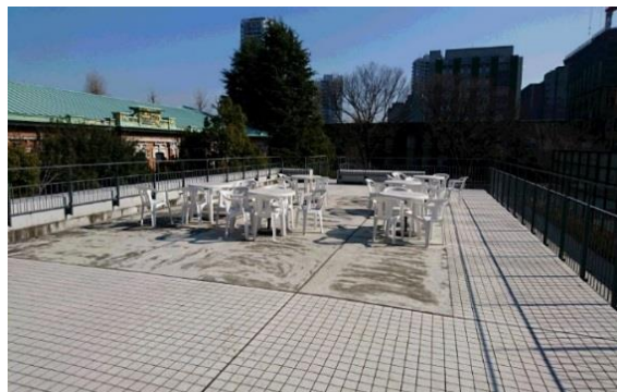
Terrace (Student Support Center 3F) Around 24 seats available