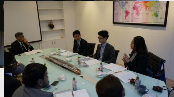
Meeting with the late Dr. Surin Pitsuwan in Bangkok, Thailand August 2017