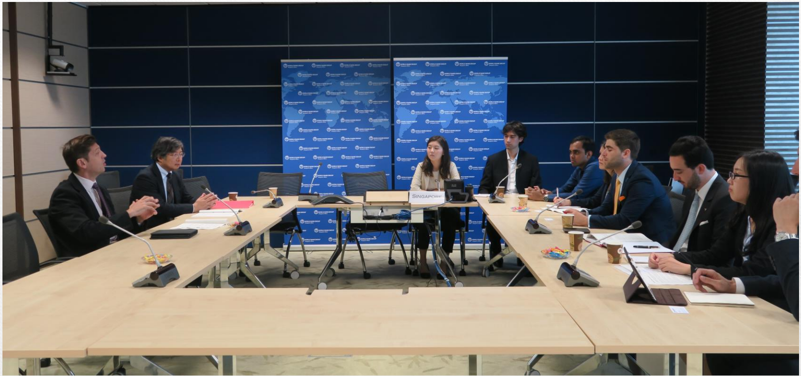
World Bank Office in Singapore August 2016