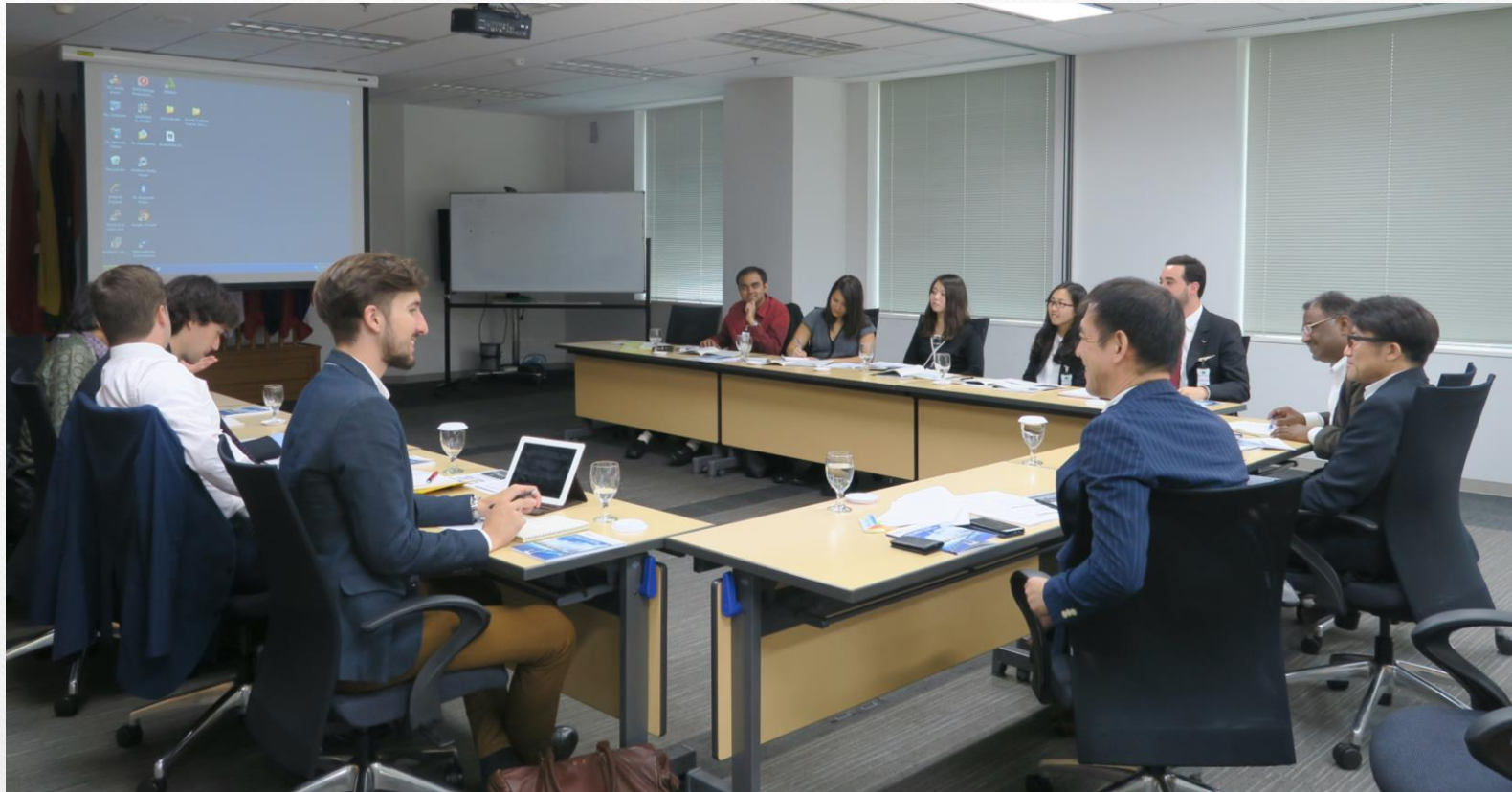
ERIA (Economic Research Institute for ASEAN and East Asia) in Jakarta, Indonesia August 2016