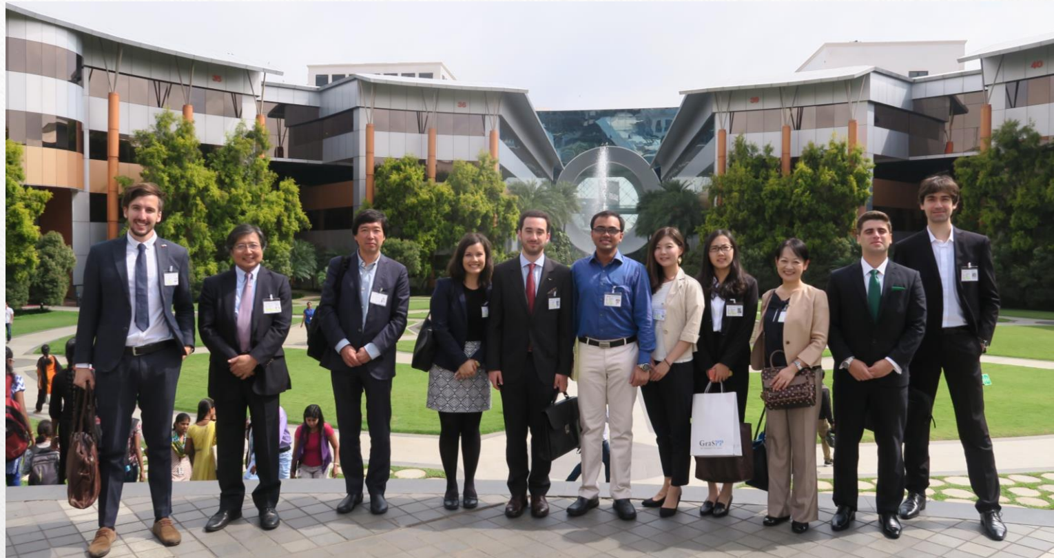
Infosys campus (corporate HQ) in Bangalore, India August 2016