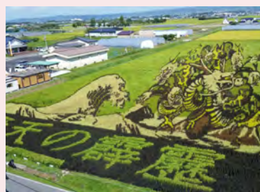
Tambo (paddy field) Art at Inakadate Village in the Minamitsugaru District of Aomori Prefecture visited in 2017. Moved by the beauty of paddy fields.

Personally, I would like to continue both with my work and my study at the university. If possible, I would love to go on and do a doctorate. Moreover, rather than just deskbound study, I would like to get more people to take an interest in Japan and in agriculture and other forms of primary industry. My hope is to get involved in extracurricular activities that convey the positive aspects of Japan, such as our cuisine which has been growing in popularity overseas in recent times.