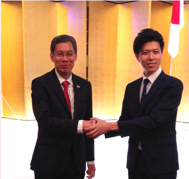
Photograph with the Singaporean Ambassador to Japan