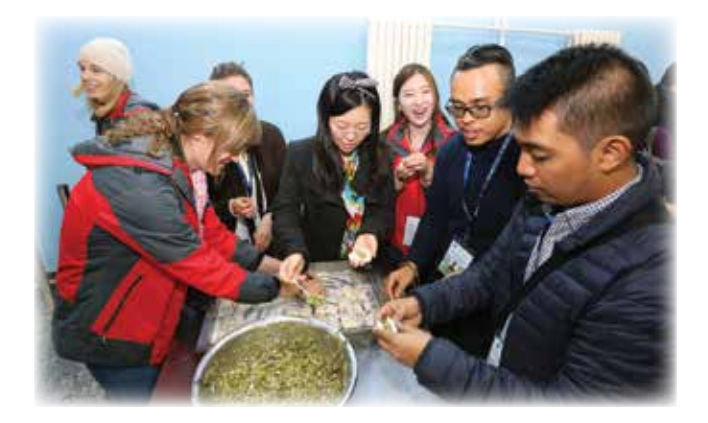
Being involved in the preparation of traditional food such as dumplings makes the visit more interesting and enriching for the delegates.

APEC Voices Leadership Council received very encouraging feedback from both government as well as the business communities as we move forward to prepare the next APEC Voices Program with the Host Economies.