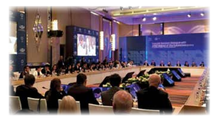
Special dialogue session between Members of the APEC Business Advisory Council and delegates from the APEC Voices at the Fairmont Hotel in Manila, Philippines.

By working and learning together, the APEC Voices young leaders are able to share their views on APEC's vision and the issues concerning their future with APEC Leaders, ministers, senior officials, ABAC members and CEOs during the APEC Week.