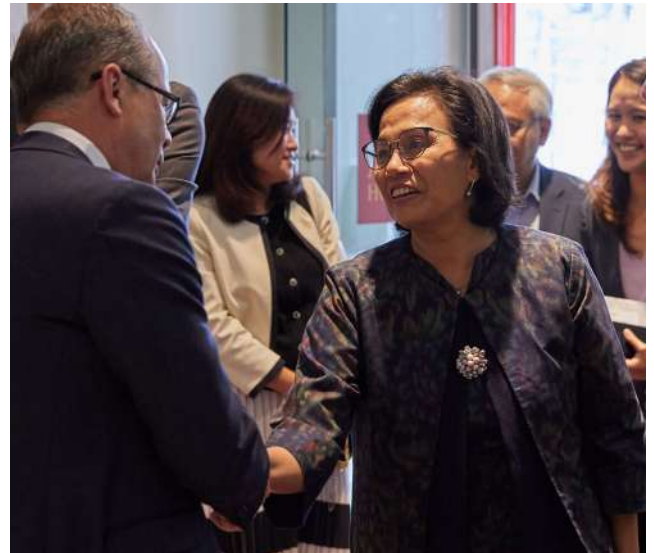
Indonesia's Finance Minister, Sri Mulyani Indrawati, meets Asia House Corporate Members in London.

Asia House's global network includes senior decision makers from governments, businesses and organisations around the world. Fellows will have the opportunity to join this network and build rewarding contacts in the sectors of interest to them.